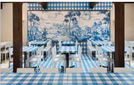
David and Goliath