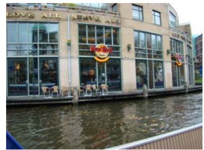
Hard Rock Cafe